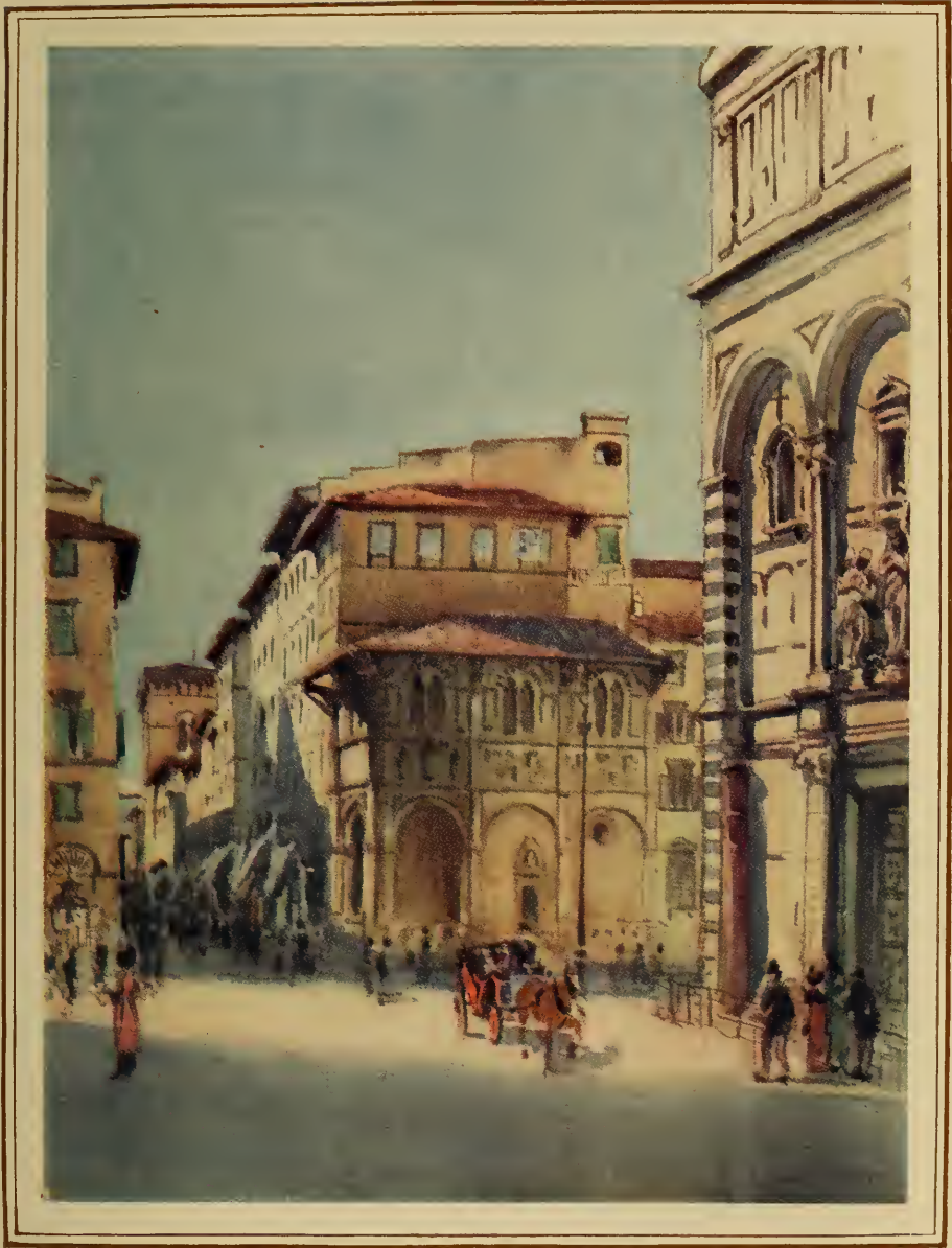
LOOKING ALONG THE VIA CALZAIOLI FROM THE BAPTISTERY, SHOWING THE BIGALLO AND THE TOP OF OR SAN MICHELE